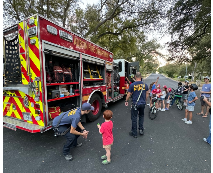
Dozens of neighbors turned out for COVNA's National Night Out, which included a tour of a fire engine from the Austin Fire Department on Oct. 1.